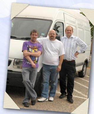
Early Furniture Bank team