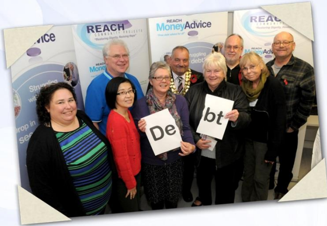
REACH Money Advice launch November 2014

REACH today – Since 2010 we have grown organically from our Resource Centre hub and we now see around 180 people per month. We run 3 headline projects – Haverhill Foodbank, the Furniture Bank and REACH Money Advice, our own ‘in-house’ debt counselling service. We have access to support from the Acts 435 charity ( www.acts435.org.uk ) an online client aid resource and now run a ‘Starter Pack’ project (basic bedding, kitchenware, etc) for those who literally have nothing.