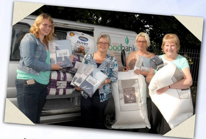
A fantastic response to a recent Starter Pack appeal

What comes next? We are developing a supported volunteer programme. Despite the improving economy, there are many needs within our community and we have ambitious plans for the future including a supported housing project with Hope into Action ( www.hopeintoaction.org.uk ) and an expansion of REACH services from other locations in the town. We continue too, to look at ways in which we can tackle the root causes of poverty locally by addressing some of the systems that keep people trapped - not an easy task! Our ultimate aim is to lift people out of poverty and give them a hope and a future.