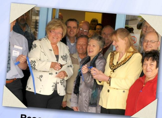
Resource Centre opening